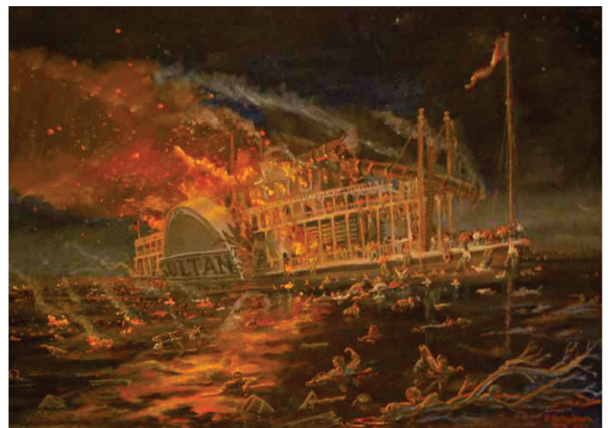
Artist's rendering of the burning "Sultana"