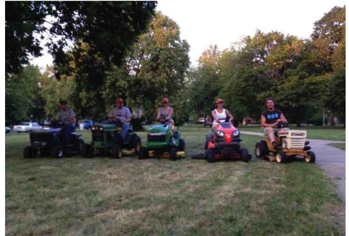
The Mower Gang

I had heard the velodrome existed, so I looked for it on Google Maps. Once I used the satellite photos, it was fairly easy to find, although in a completely different part of the city than I thought it would have been. Then I went to visit it and saw that it was in rough shape. I knew that if I wanted to ever ride around it or use it for fun activities that I would need the help of other groups. I let any other group I could find know what I was going to do and I invited them to come help. I contacted RC car groups, bicycle groups, mountain bikers, and minibike clubs. I asked for volunteers and the Mower Gang was born.