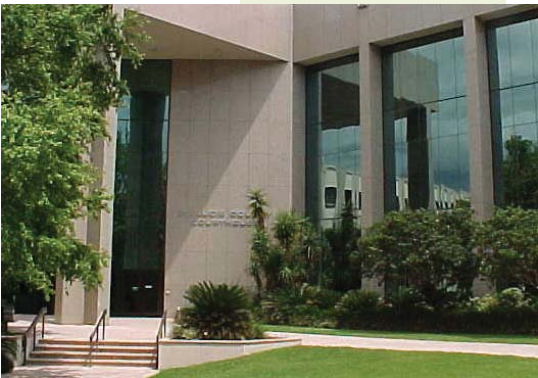
St. Lucie County Courthouse

These sources are available for any library patron to use at no charge from within each library. These electronic resources include free access to all primary law on Westlaw including citation checking with KeyCite.